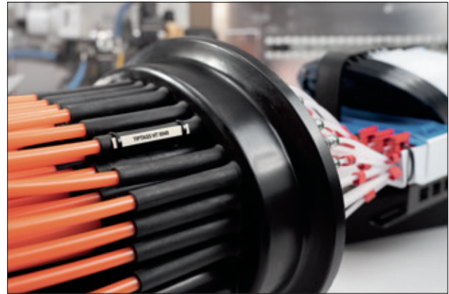
TIPTAG - high performance cable bundle marking.