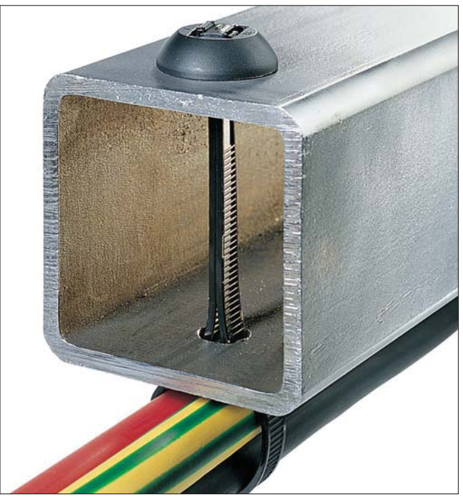
BHT375 - used for mounting cables via a single hole.