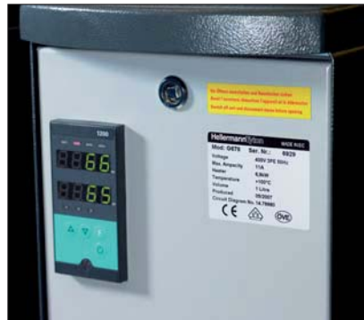
Professional type plate on a heating unit.