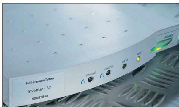
HELATAG label for a permanent asset identification.