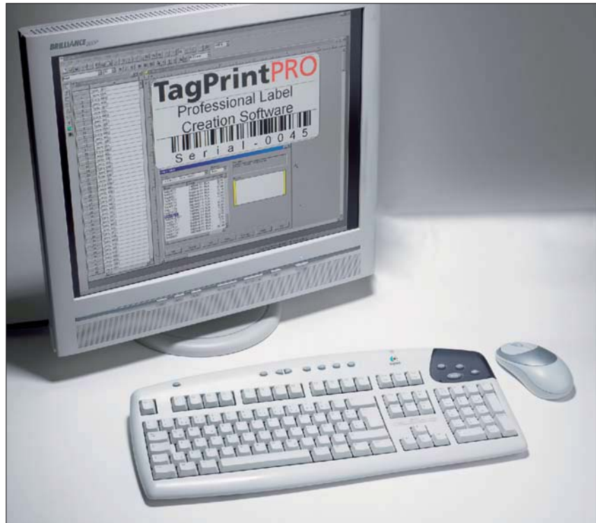
Tagprint Pro Label Creation Software.

Tagprint Pro can be utilized with HellermannTyton's wide array of label options including laser, ink jet, dot matrix and thermal transfer printable labels.