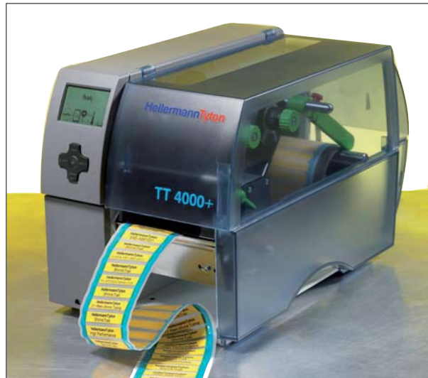
TT4000+ series printer.

For problem-free printing we recommend Tagprint Pro, page 203.