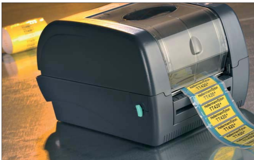
Thermal transfer printer (TT420+).