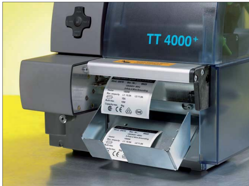
Cutter S4000 for both TT4000+ and TrakMark DS.