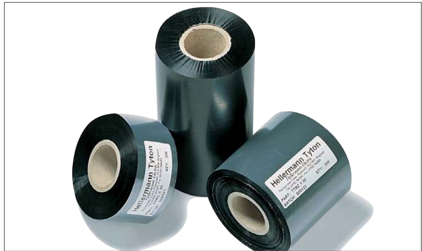
Ribbons for printing on labels.