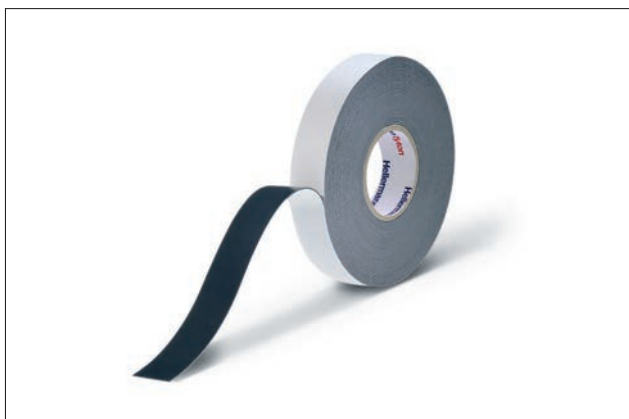
HelaTape Power 810 enables jacketing splices up to 69 kV.