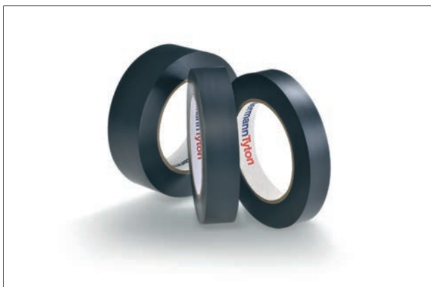
HelaTape Flex 23 for higher mechanical and electrical demands.