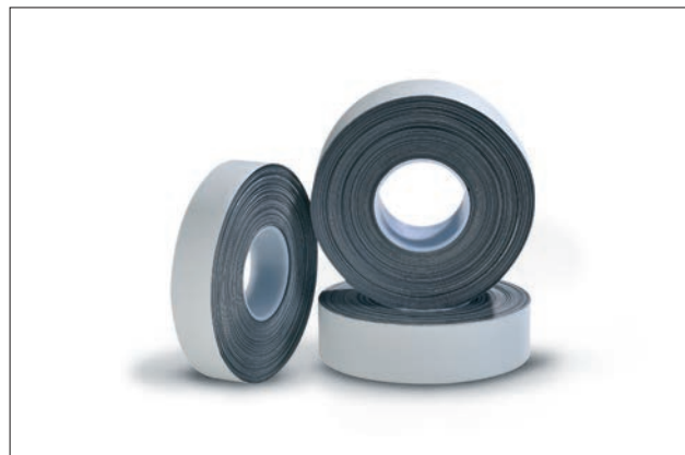
HelaTape Power 900 - For insulating and jacketing splices on power cables from 600 volts up to 138 kV.