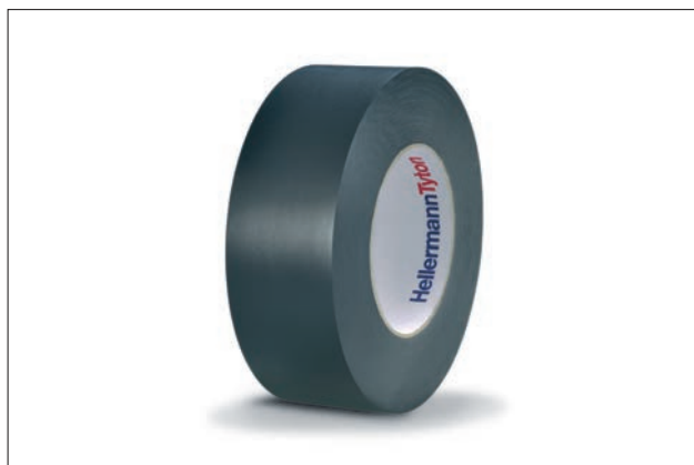
HelaTape Flex 40 for higher abrasion resistance.