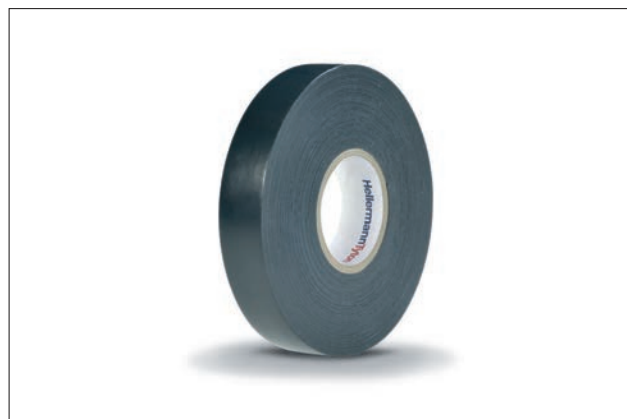
The high-voltage tape HelaTape Power 820 yields a uniform and void-free build-up.