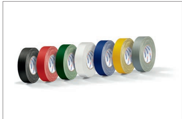
HelaTape Tex is available in various colours and sizes.