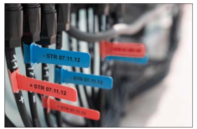
TAGPU LOOP - Cable marking solutions for labeling on the inverter.