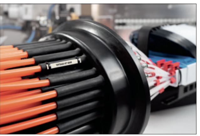
TIPTAG - high performance cable bundle marking.