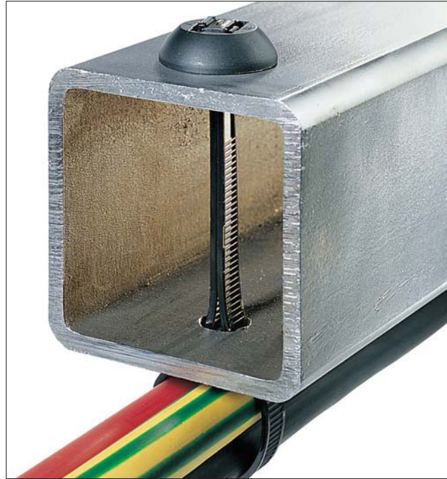
BHT375 - used for mounting cables via a single hole.