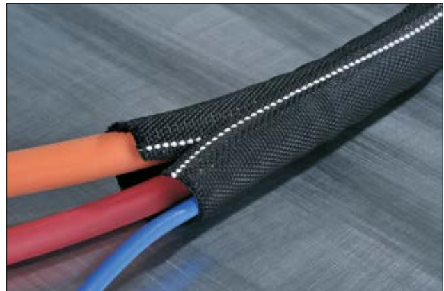
Helagaine Twist-In-FR with the white identification yarn.