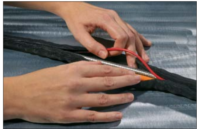
Helagaine Twist-In gives easy access to cables and wires for inspection, maintenance and assembly.