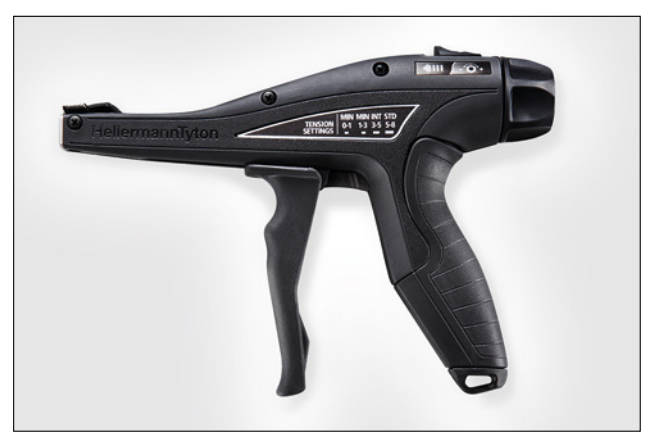
The EVO7: Maximum performance with minimum effort.