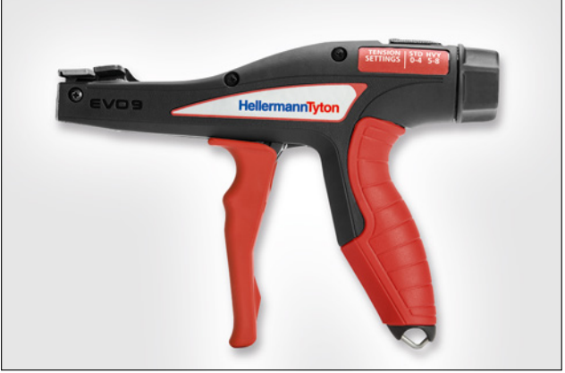
The EVO9 with TLC-Technology.