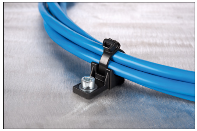
X-series provides a superior fixing solution for tight applications.

Minimum Order Quantity (MOQ) may differ from package content. Other packaging options may also be available.