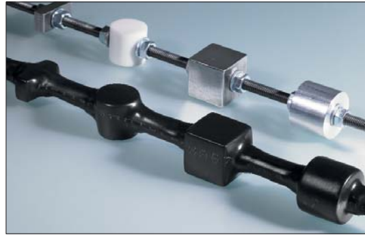
Due to the high shrink ratio HA67 is suitable for complex shapes and dimensions.