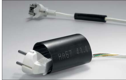
Ideal for applications with highly varying diameters like cable connector configurations.

Insulates, seals and protects large size differences between connectors and cables.