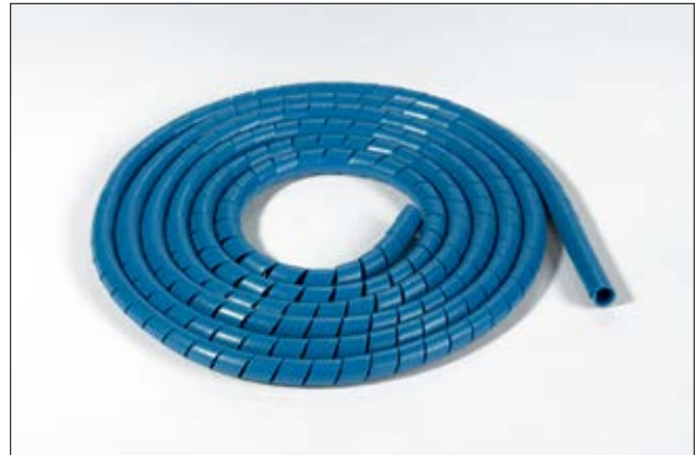
SBPEMC metal-content spiral binding.