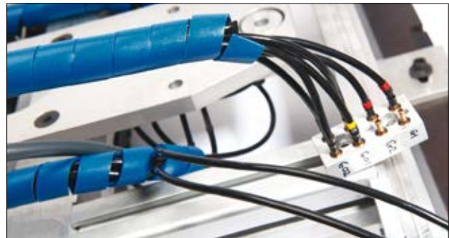
Detectable, metal-content spiral binding protects cables on food-processing machines.