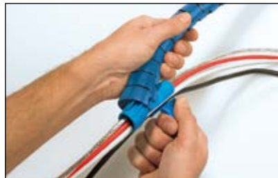
Place the applicator tool in one end of the Helawrap cable cover.