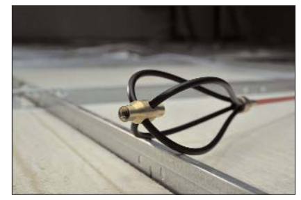
The whisk allows the rod to glide over obstructions easily