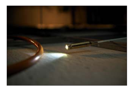
The Cable Scout+ Beam – a perfect tool for seeing into cavities.

Due to the wide range of innovative accessories and different flexibilities Cable Scout+ is perfectly suited for many different applications.