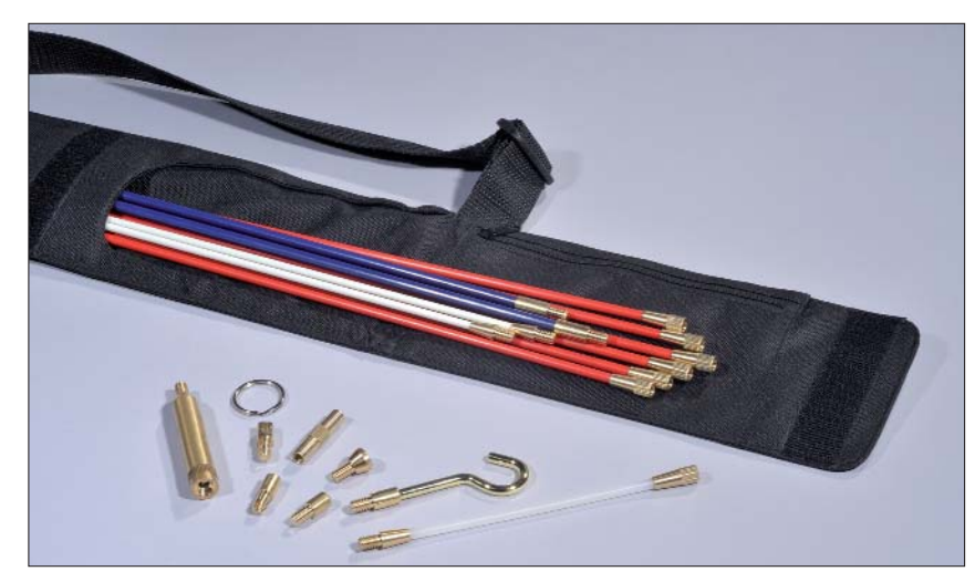
All components stored neat and tidy with the Cable Scout+ Deluxe set.

Cable Scout+ is a professional cable installation tool which enables installation jobs to be done in record time even in the most challenging environments. Rods made of glass reinforced plastic (GRP) are able to pull a cable weight of up to 80 kg. The product also allows its user to inspect, illuminate and retrieve. The complete system integrates rods, a variety of useful attachments and a bag to store all parts in one place.