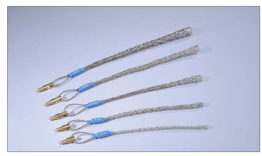
Cable Grips are available in five different sizes to attach a wide range of cable diameters.

Cable Grips are designed to grip objects from the outside and provide a very reliable super fast method for securing pipes and cables to the rods. Just open a grip by compressing the braided sleeving, push it over a cable and let go, the material will contract immediately and establish a tight fastening of the cable to the tool.