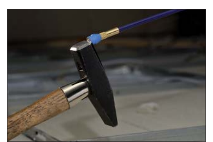
The strong magnet lifts a metallic tool of up to 2.5 kg.