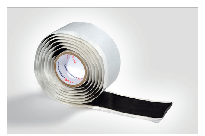
HelaTape Power 31 jacket repair mining tape.