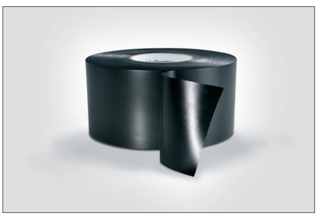
HelaTape Wrap 25 protects against all types of corrosion.