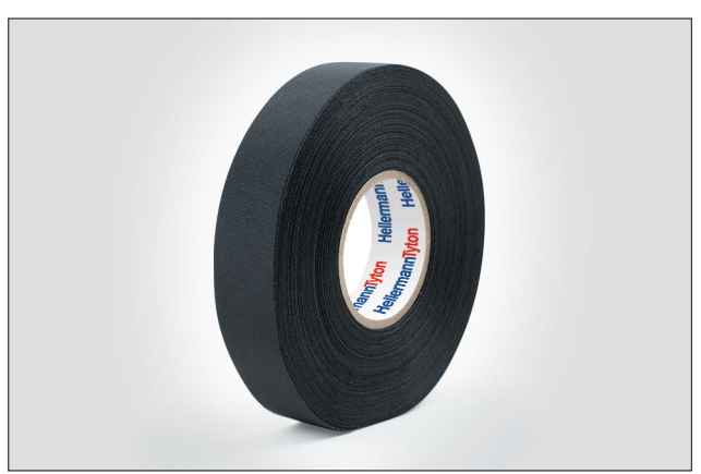
HelaTape Protect 250 is designed for cable harnessing and offers a very high temperature resistance.