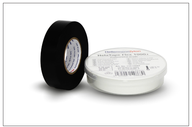
HelaTape Flex 1000+ provides excellent performance over a wide range of temperatures.