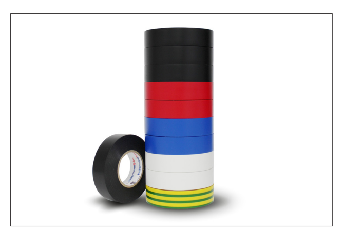
Highly flexible and with good adhesion levels HelaTape Flex 15 can be used in several applications.