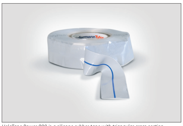
HelaTape Power 800 is a silicone rubber tape with triangular cross-section.