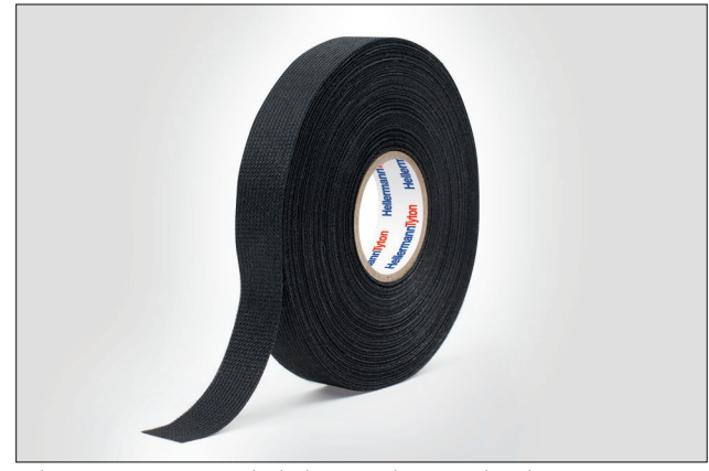
HelaTape Protect 300 provides high noise reduction and media resistance.