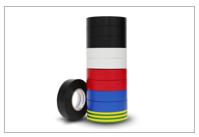
HelaTape Flex18 for general splicing purposes.