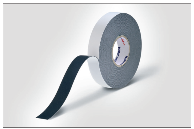
HelaTape Power 810 for primary insulation up to 69 kV.