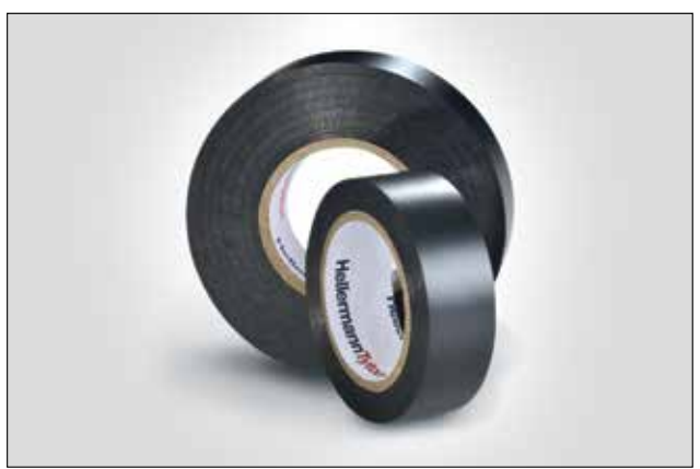
HelaTape Flex 2000+ is the best choice for professional installation.