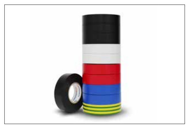
HelaTape Flex18 for general splicing purposes.