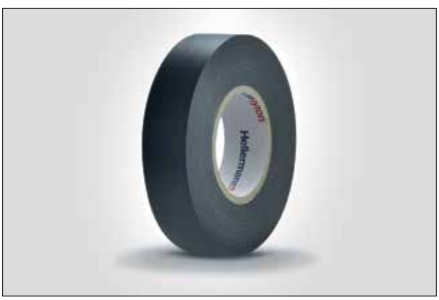
HelaTape Flex 20 - Higher thickness for quicker layering.