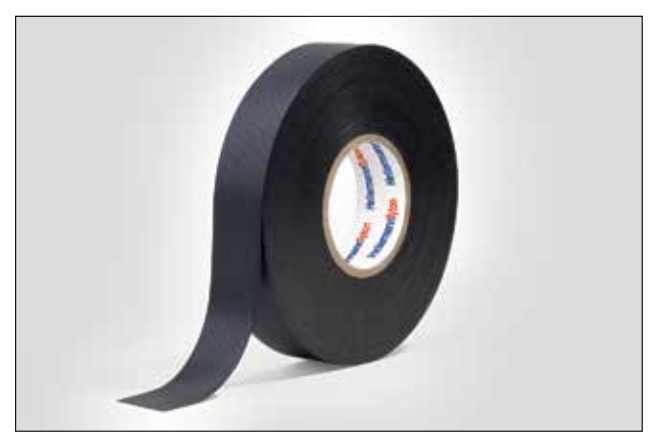
HelaTape Power 700 is a self-amalgamating medium voltage rubber tape.