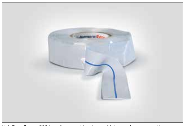
HelaTape Power 800 is a silicone rubber tape with triangular cross-section.