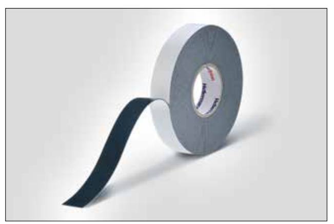
HelaTape Power 810 for primary insulation up to 69 kV.