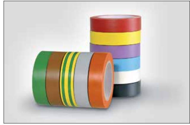
HelaTape Flex 15 is a commercial grade, weather resistant vinyl tape.