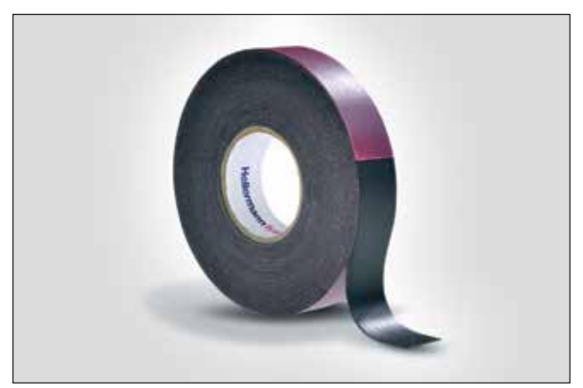
HelaTape Power 600 is a self-amalgamating low voltage rubber tape.