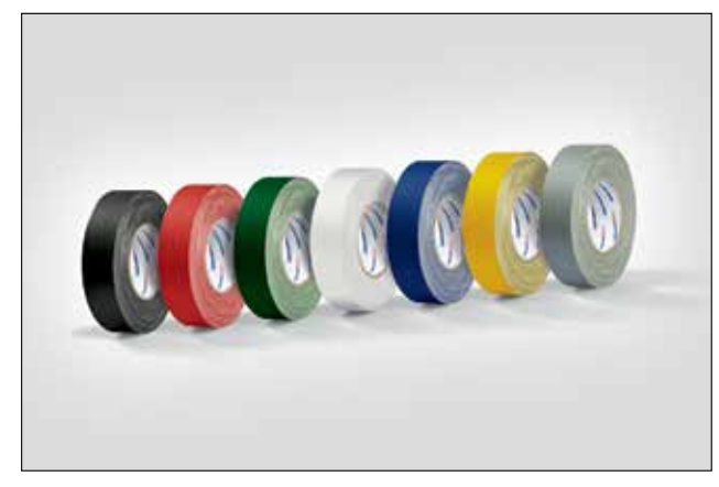
HelaTape Tex is available in various colours and sizes.