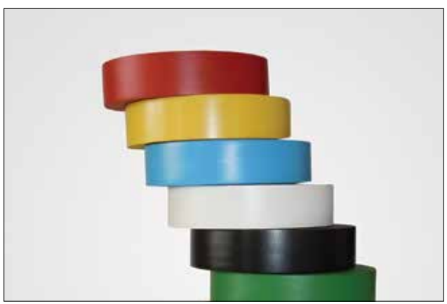
Highly flexible and with good adhesion levels, HelaTape HWT10 can be used in several applications.