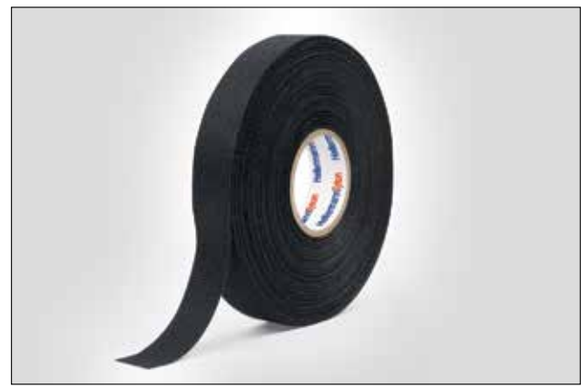
HelaTape Protect 300 provides high noise reduction and media resistance.