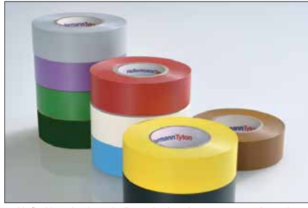
Highly flexible and with good adhesion levels, HelaTape HWT12 can be used in several applications.