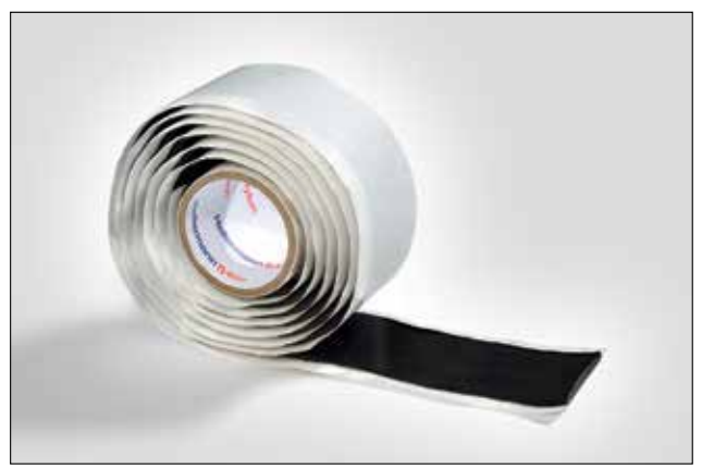
HelaTape Power 650 self-amalgamating mastic is highly flexible.