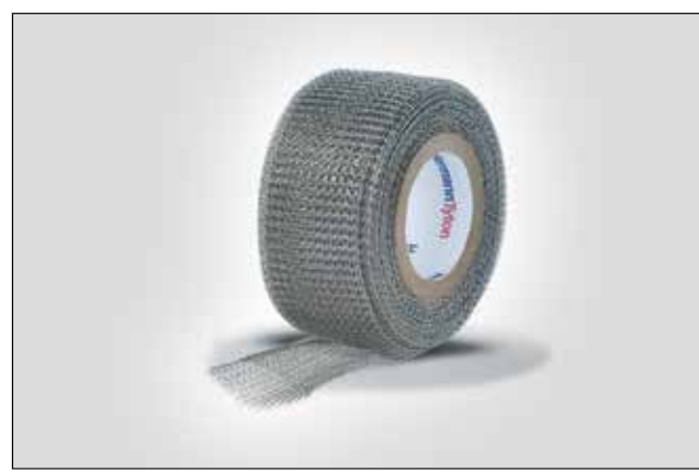
HelaTape Shield 320 provides good electromagnetic shielding.