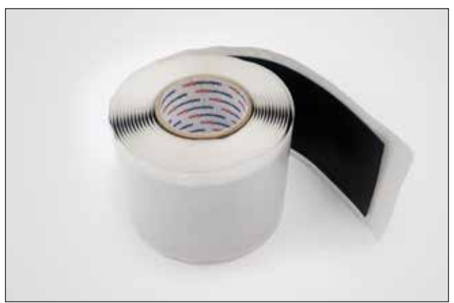
HelaTape Power 31 jacket repair mining tape.