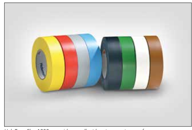
HelaTape Flex 1000+ provides excellent low temperature performance.