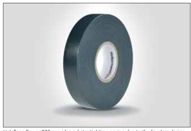
HelaTape Power 820 provides substantial time saving due to the linerless design.