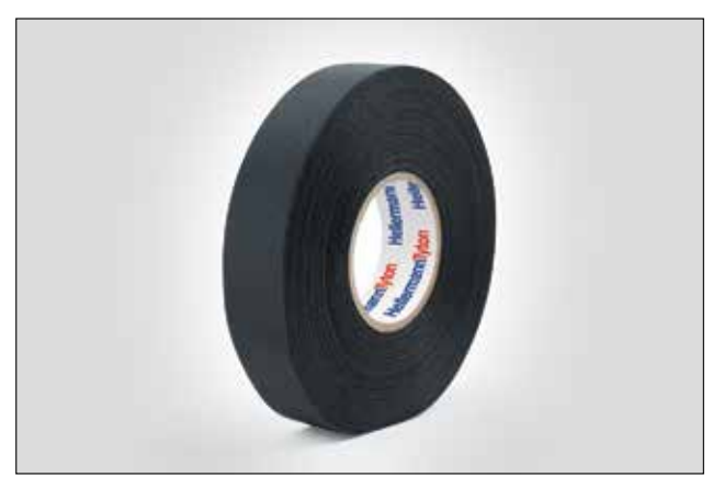
HelaTape Protect 250 is designed for cable harnessing and offers a very high temperature resistance.