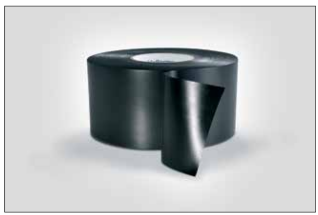
HelaTape Wrap 25 protects against all types of corrosion.