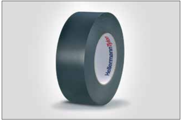
HelaTape Flex 25 for higher abrasion resistance.