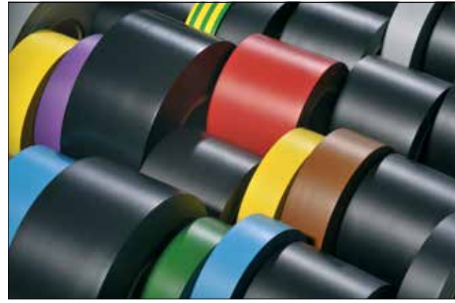
HelaTape Flex 13 is a commercial grade, weather resistant vinyl tape.