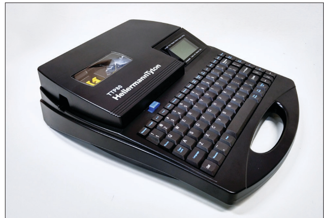
The portable embossing machine eKUBE: Patent Number: SG2013/000083