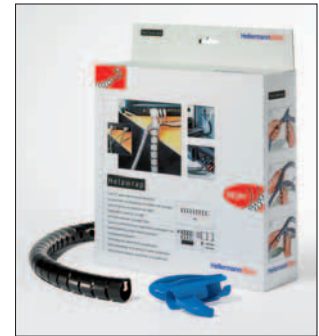
Helawrap, the fast and easy solution to your cable chaos.