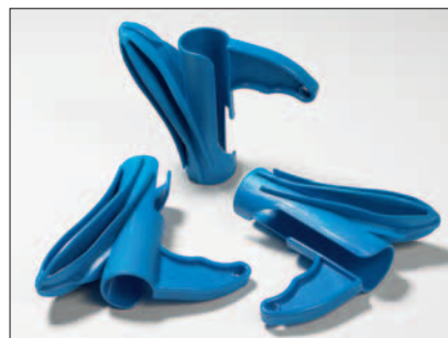
Applicator tools HAT are available for every Helawrap cover size.

The new Helawrap applicator tool enables the user to bundle cable rapidly and effortlessly. The applicator tool has been optimised to glide smoothly through the cover and allows easy insertion of cable into Helawrap. The unique design also allows individual cables to be removed from the applicator tool and branched off through the cover apertures. A tool is included with every Helawrap package. Additional tools can be purchased separately.