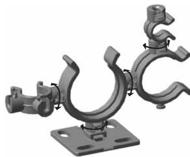
Multiple clips can be joined. Clips swivel freely.

Helawrap accessory clips and mounting plates can be linked together to bundle, protect and fix any number of cables on industrial machines as well as in wiring cabinets, particularly in the door area where movement is a requirement. Helawrap accessories are also used to manage cables in the office or home.