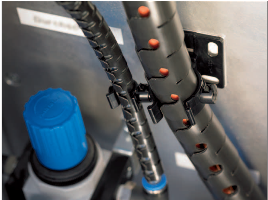
With the Helawrap accessory set, cables can be bundled, protected and fixed in wiring cabinets and industrial machines.

Helawrap is used to bundle and protect cable and wiring in the electrical industry, in panel building, on machines and in automotive and truck manufacturing where movement and vibration are experienced. Due to its excellent flame-retardant properties, the halogen-free Helawrap HWPV-V0 is the product of choice wherever fire protection is essential, for example in mass transit.