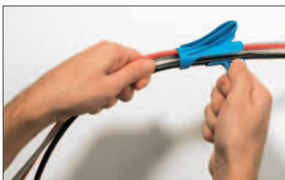
Insert one or more cables into the insertion slot of the applicator tool.

All Dimensions in mm. Subject to technical changes.