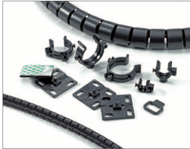
The Helawrap accessory set for bundling, fixing and protecting multiple cable runs.