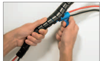
Simply slide the applicator tool through the Helawrap cover.