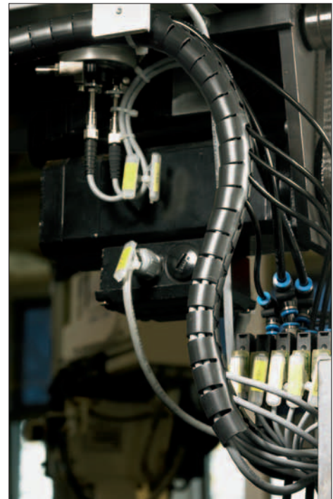
Cables can be branched off at any point for better, more flexible protection.