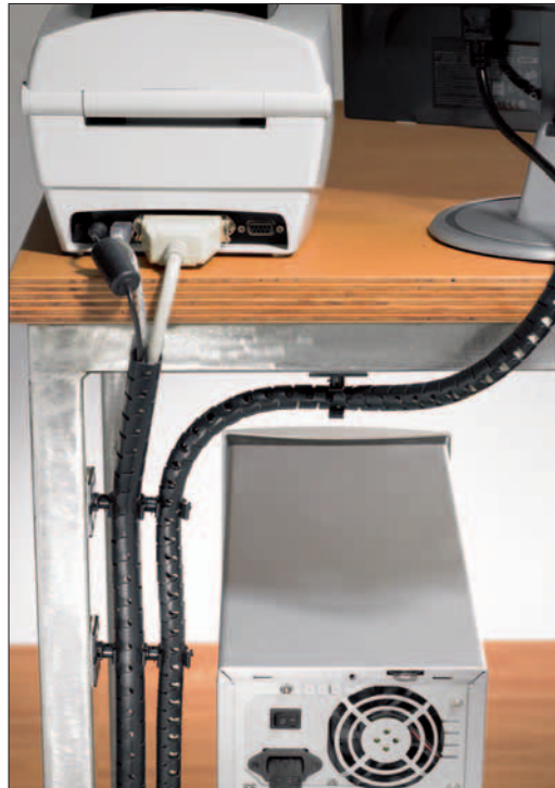
Large choice of colours for various home and office environments.

The versatile cable cover organises and protects the cables and wires of your PC, TV set, DVD player, VCR or hi-fi system. With the Helawrap accessory set, multiple Helawrap cable covers can be joined and mounted firmly to tables, desks, cabinets or walls.