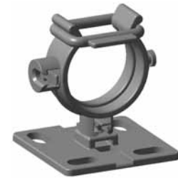
For secure hold, R1 loop can be used (for HWClip25 and HWClip30 only).