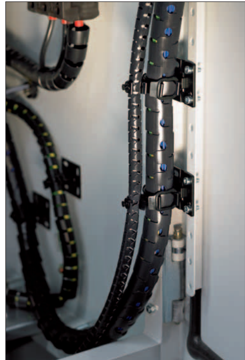
Protecting, fixing and bundling cables with the Helawrap cable cover and accessory set, e.g. in wiring cabinets.

All Dimensions in mm. Subject to technical changes.