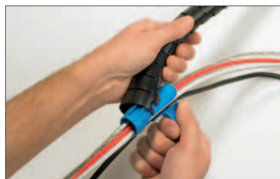
Place the applicator tool in one end of the Helawrap cable cover.