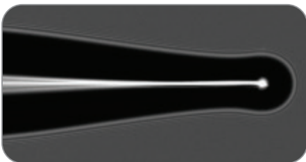
Tapered Probe with Small Ball End