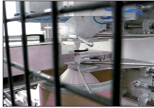
Horizontal application of the ATS3080.

The plastic bags are placed inside large containers and move from station to station along a conveyor belt. Once the bags have been filled, the container is forwarded to the closing station. At the sealing station, the plastic towards the top of the bag is gathered together by two V-shaped slide bars to a diameter of approximately 50 mm. The ATS3080 is a permanently integrated component of the fully automated system. Since the area in which the entire process is completed is potentially fire hazardous, the system has been encapsulated to provide protection against the high levels of fine dust prevailing in the atmosphere. Once binding is initiated by the equipment's start signal, the horizontal dispenser on which the ATS3080 is mounted moves towards the plastic bag. The operation to close the bag with a cable tie is fully automatic and takes approximately 1.3 seconds. Unlike its standard market equivalent, the cable tie is made from a continuous strap and separate closures - as a result, the binding process is entirely waste-free.