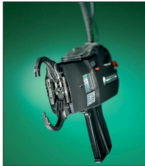
The Autotool 3080 system.

The AT3080 is the ideal choice for maximum application flexibility. There is no alternative to this system available on the market. The device can be supplied with quick-replace binding jaws measuring 30, 50 and 80 mm, facilitating the fully automatic bundling of diameters from 1 mm to 80 mm. Bundling speeds range from 0.8 to 1.6 seconds per cycle dependent upon bundle diameter. A two-part closing system comprising an outside serrated strap on a continuous reel and separate closures means that absolutely no waste is produced by the binding process. Furthermore, the AT3080 is able to bind a large number of clips fully automatically.