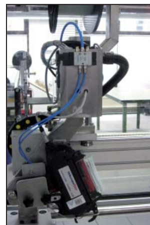
The AT2000 as a fixed integral component of the robot cell.