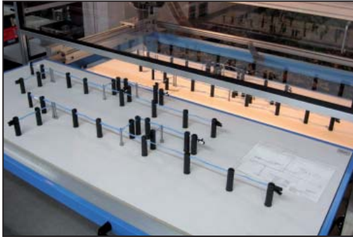
Harness board with a Fresenius cable harness.

Calculated for the complete cable harness, binding takes an average of 2 seconds, including the distance travelled. Fresenius manufactures many different products, although the majority are small types of cable harnesses. To make the most efficient use of the boards for laying out the cables, two harnesses are often laid out one next to the other on a single board.