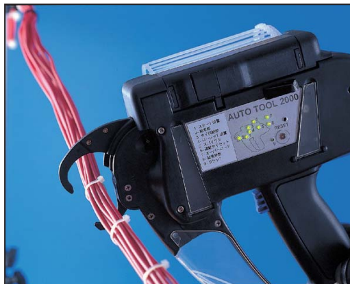
Cable ties can be attached and fastened in just seconds.

With the Autotool 2000 cable ties can be bundled, tightened and cut flush in a cycle lasting just 0.8 seconds. The maximum bundle diameter is 20 mm. Since the binding of the AT2000 can be adjusted to meet individual requirements, the tool is able to process both bands of 50 cable ties and reels with a capacity of 3500 ties.