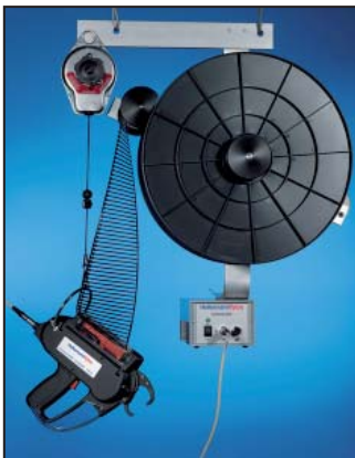
AT2000 with overhead dispenser for mobile application.