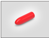
HT-BD-2 Test Dart.