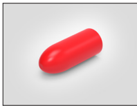
HT-BD-3 Test Dart.