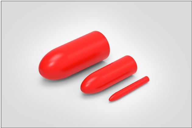
Test Dart for microduct (16mm, 10mm and 3.5mm Duct ID).

A range of test darts designed to test the integrity of microduct after installation. The darts are available in three sizes providing integrity testing for ducts with an internal diameter of 3.5mm, 10mm and 16mm. The darts are supplied in packs of 50 for the 11.45mm diameter dart and packs of 100 for the 2.65mm and 7.15mm diameter dart.