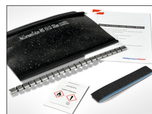
Split Heatshrink Repair Kit Content.