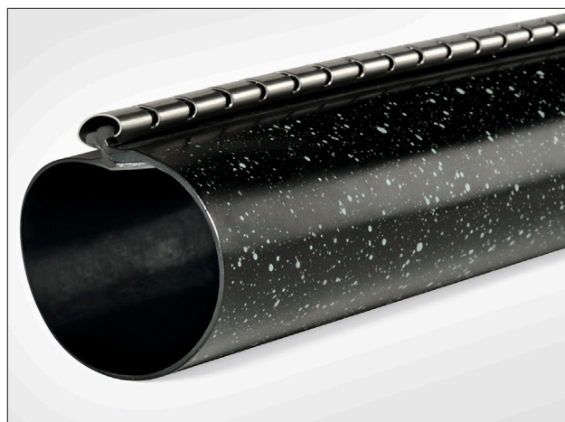
Split Heatshrink Repair Kit.