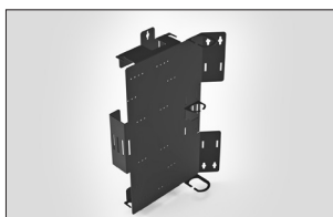
MB-AFN/FFE-PB001 AFN/FFE pole mounting bracket.