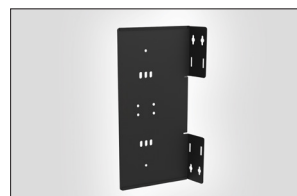
MB-AFN-DUAL-BRKT Dual pole mounting bracket for the AFN.