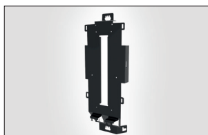
MB-AFN/FFE-PWB-001 AFN/FFE pole mounting bracket.