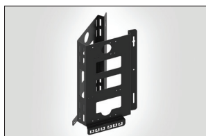
MB-AFN/FFE-V-BRKT-V2 Lightweight 400mm V Bracket.