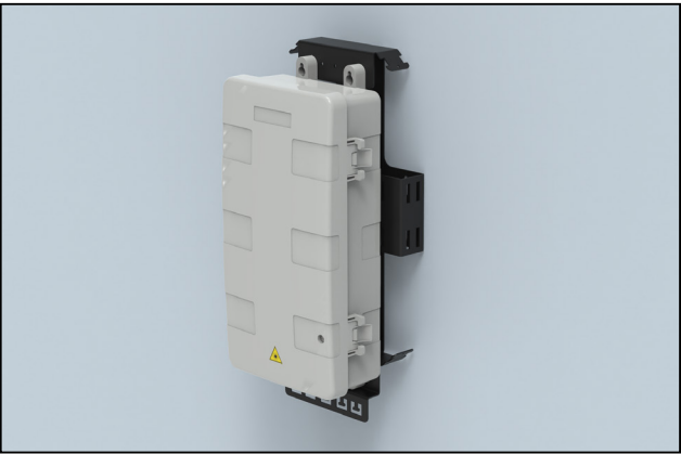
Wall Mounting Bracket with AFN.