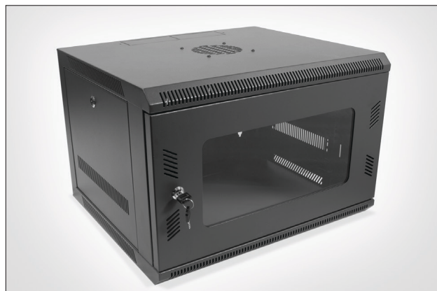
HTC 6U 450mm Deep Wall Box - Front View.