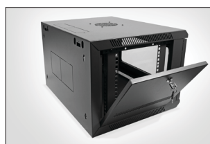
Removable Side Panels.