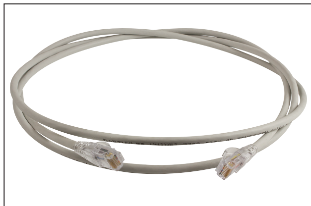
Category 6A LS0H Unshielded Patch Leads

The patch leads are supplied standard 1m, 2m, 3m, 5m lengths in grey, other lengths and colours are available on request.