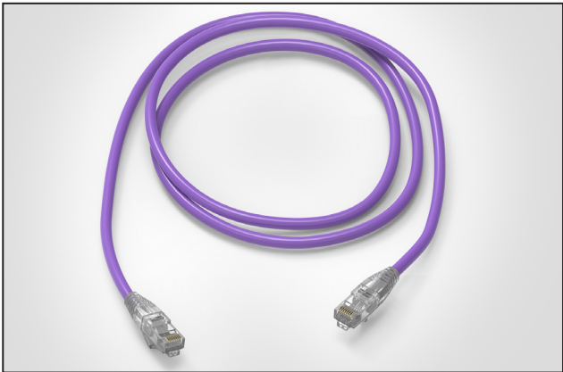
Category 6 U/UTP Solid Core Patch Leads.