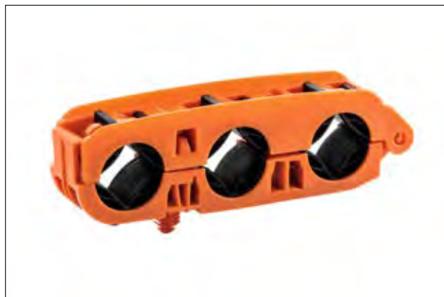
Triple high voltage clip in PA46 / AEM with firetree.