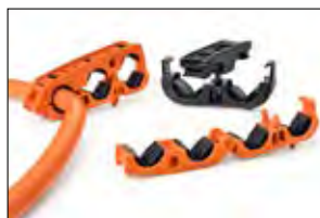
Double and triple high voltage clips.