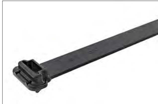
The wide strap cable tie accommodates a large range of bundle diameters: 9,5mm - 104mm.