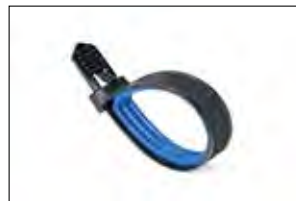
Soft Grip Cable Ties (2-component cable ties).

Please find more Soft Grip Products on page 89.