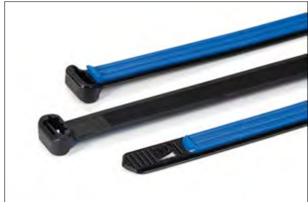
Soft Grip Cable Ties (2-component cable ties).