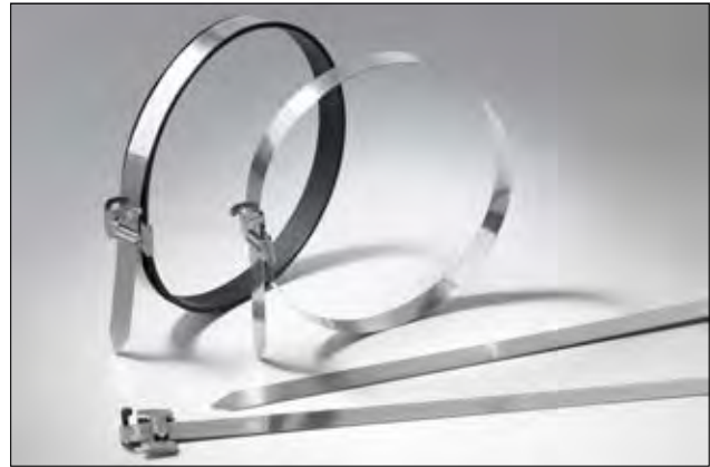
AMT Ties with and without protective profile.

For hard, smooth surface applications, we recommend the use of our LFPC protective channels. More details please find on pages 32 and 82.