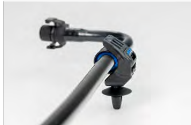
Soft Grip Cable Tie assembled with Soft Grip Mount for holes (arrowhead) and a hose for fluid management.