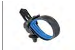
Soft Grip Cable Tie assembled with Soft Grip Mount for holes (arrowhead).

Please find more Soft Grip Products on page 57.