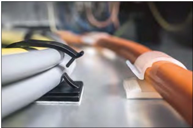
Self adhesive one piece fixing mounts RB20 (l) and RB14 (r).

For more information on the types of adhesive please see page 165.