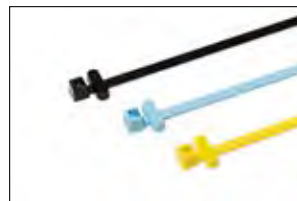
T50RFID – cable ties with RFID transponder.