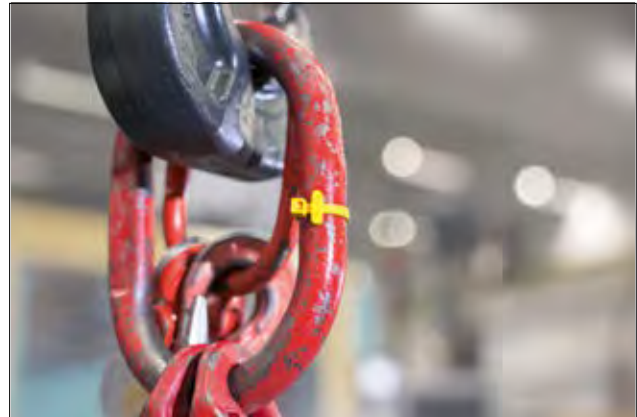
T50RFID – clear identification even under harsh conditions.