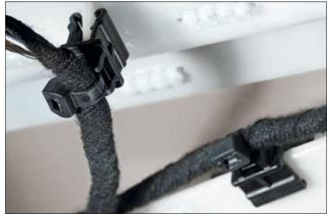
T50ROSEC10 fitted onto a plastic panel to hold a Ø 6 mm harness.