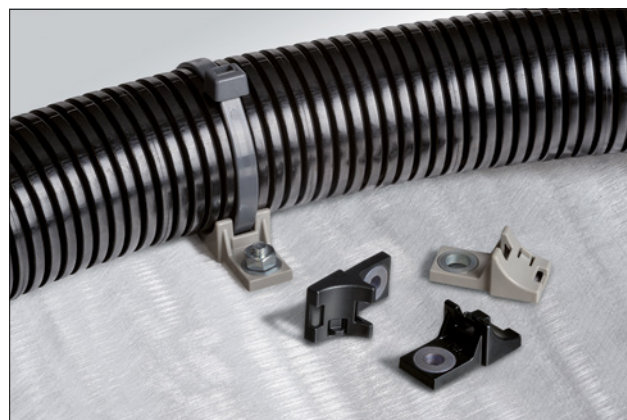
These HDM are suitable for assembling on screws.