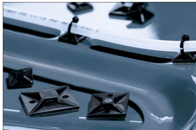
SolidTack products work on varnished and powder coated surfaces.