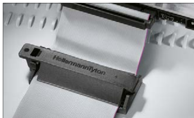
Based on extremely soft wings any flat cable is gently fastened.