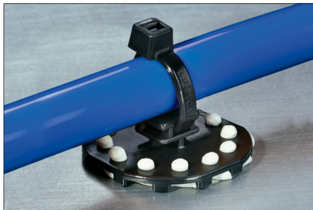
PMB5 mount with paste adhesive.