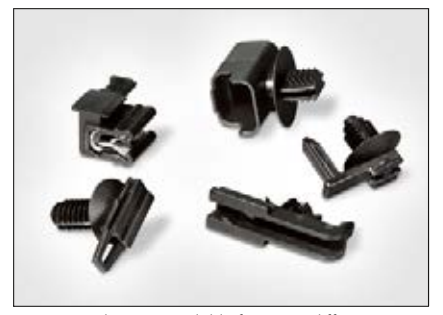
ConnectorClips are available for many different connector types and fixing varieties.