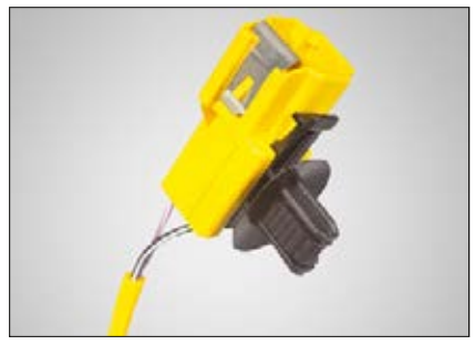
For a secure fixing simply push the connector by hand (ConnectorClip YCCFT62x122).