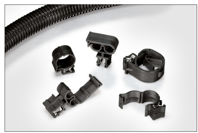
EdgeClip cable and tube clips are suitable for the low-vibration routing of cables and tubes with larger bundle diameters.