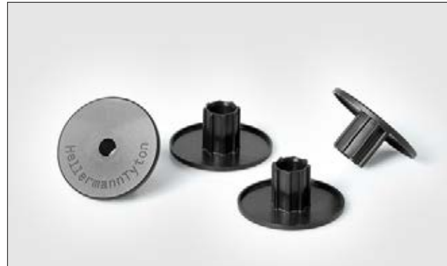
SpotClip-Caps offered in a pack of 4 pieces.