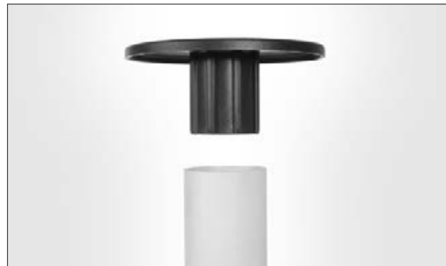
SpotClip-Cap fits into standard 25 mm diameter SpotClip-Tube.