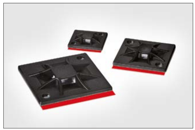
Mounting bases Q-Mount.