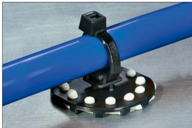
PMB5 mount with paste adhesive.