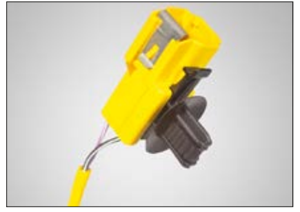
For a secure fixation simply push the connector by hand on our Connector Clip YCCFT62x122.