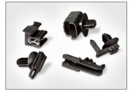
Connector Clips are available for many different connector types and fixing varieties.