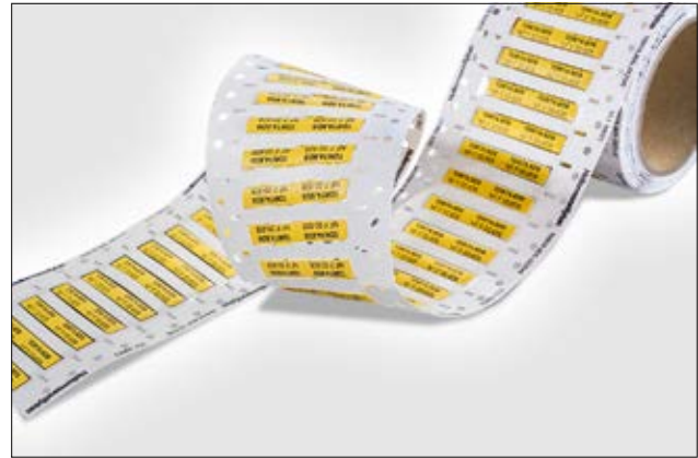
Shrinkable rail diesel resistant markers TDRT DS.