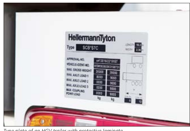
Type plate of an HGV trailer with protective laminate.