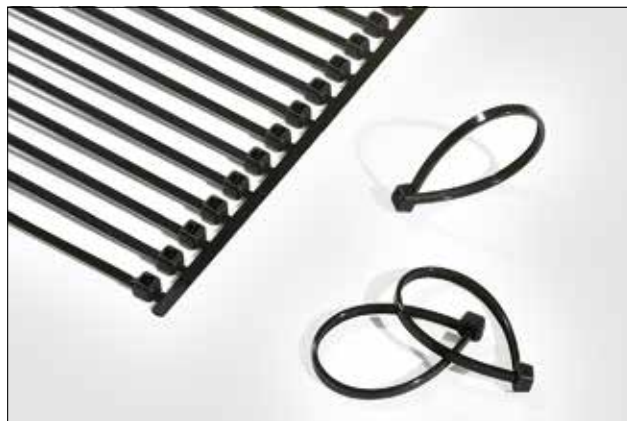
Cable ties for Autotool 2000 systems.