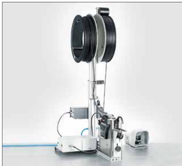
Bench mount kit 3080 with foot pedal (also shown: Autotool System 3080, Power pack 3080 and consumables).