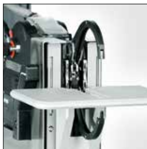
Optional: Bench mount kit 3080 with table board.