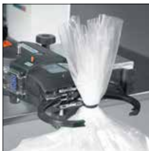
Packaging application with Bench mount kit horizontal 3080.