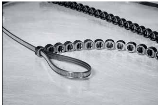
Closures and strap for Autotool System 3080.