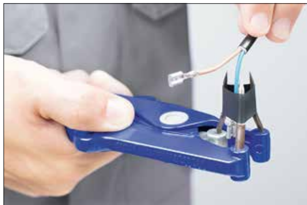
Fast, secure application with the three-pronged expansion tools.