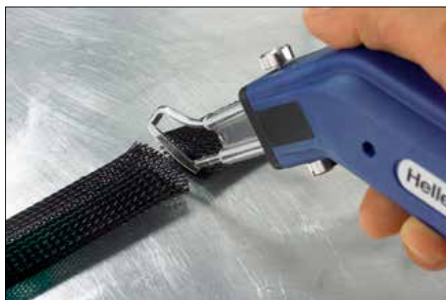
The HSG0 hot cutting tool prevents the braided sleeving from fraying.