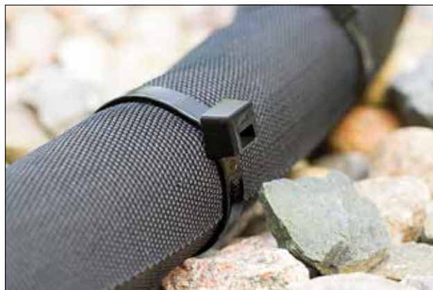
Impact resistant T-Series cable tie (PA66HIR(S)).